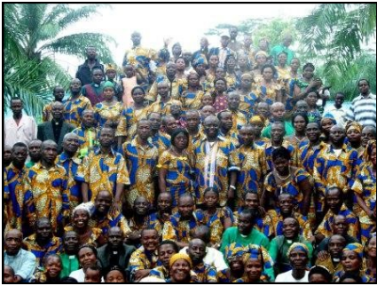
All the participants at the recent clergy conference