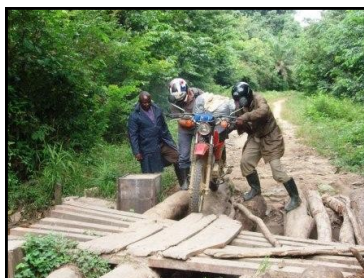
Many villages in this diocese are isolated and inaccessible to cars

The logistics of organising an election in DR Congo are huge and the process has already started. Every voting member of the population must be registered and issued with an election identity card. To do this requires generators and computers to be taken to every village by road, bicycle, canoe or even helicopter. On the day of election ballot papers must also be distributed to even the most isolated villages.