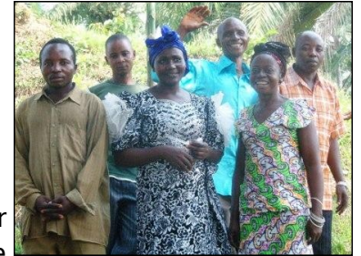
Recent Bible School graduates

It is planned to make this a part of the Bible School program each year.