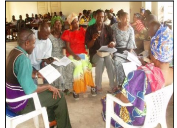
In small group Bible studies pastors and their wives studied the book of 1 Peter.